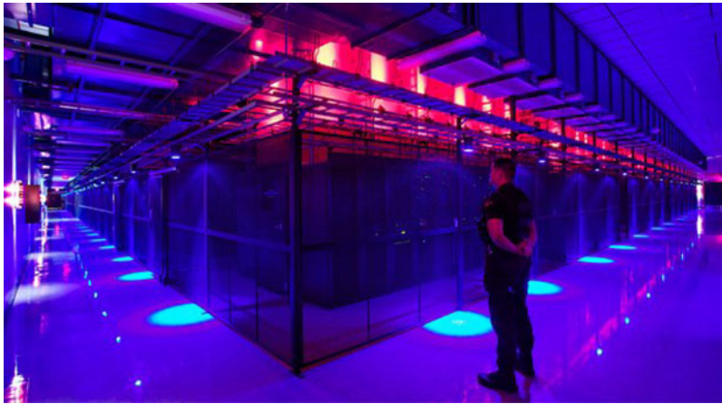
Fig. 2. The Cloud Factories: Power, Pollution and the Internet. Data centers are filled with server, which are like bulked desktop computers, minus screen and keyboards, that contain chips to process data.